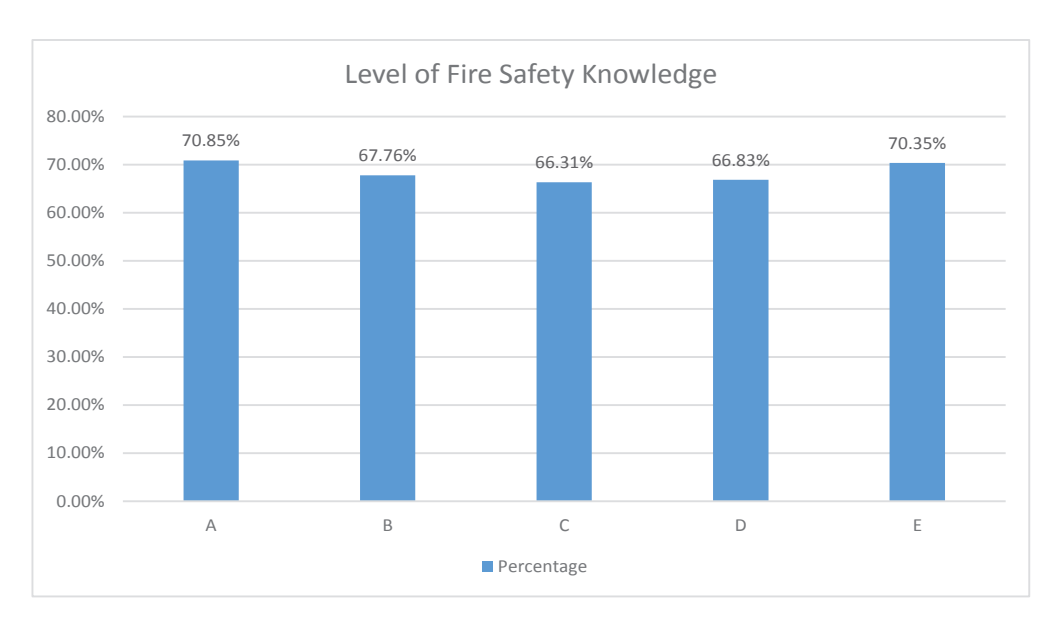
Figure 3 Level of fire safety knowledge by residential colleges

In a study by Altabbakh et al. (2015), respondents were asked about knowledge and fire safety procedures. The question was designed to assess students' knowledge offacility evacuation procedures, usage of portable fire extinguisher and others. Only 47% of respondents knowhow to use the firefighting equipment or evacuation task execution. As a result, the students do not know how to properly respond to a fire, or do not know the proper evacuation route and assembly point. In this study, it was demonstrated that 63.1% of students did not know who to notify during fire emergencies. Mostly the students do know how to use fire extinguisher and other firefighting facilities of their colleges. Since having this questionnaire distribution enable us to identify what type of fire safety campaign to be injected for the students, the evaluation of fire safety knowledge can now be implemented by the residential colleges personnel easily.