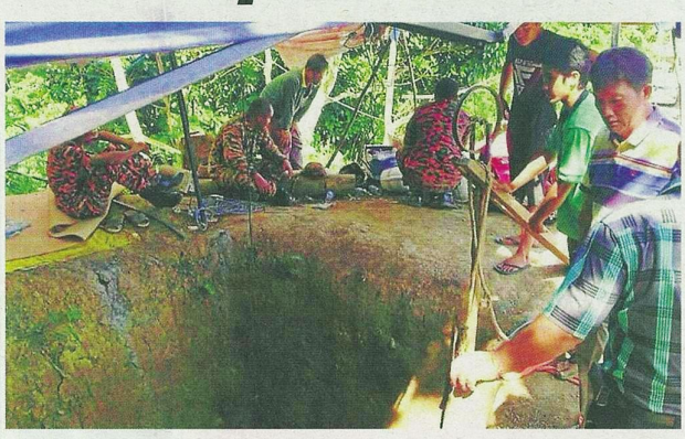
Deep passage: Rescuers near the opening of the tunnel that goes 20m underground.