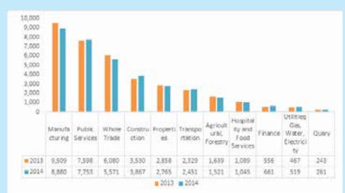
FIGURE 2: Accident reported according to industry for 2013 to 2014 (SOCSO, 2015)

This data is further supported by statistics from Social Security Organization (SOCSO) in 2013 and 2014 (Figure 2) showed that manufacturing sector is the main contributor to accident cases which was about 25% in 2014 and in 26.5% in 2013, followed by services, wholesale and construction sectors.