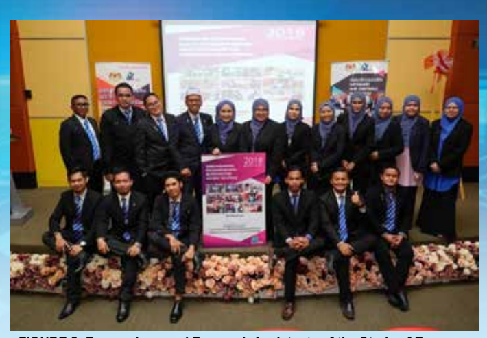
FIGURE 5: Researchers and Research Assistants of the Study of Exposure and Control of Health Hazards in Industry

Since it is no longer sufficient to simply identifying hazards and assessing the risks, NIOSH should now aim at increasing the understanding on the prevention and control, and focusing the intervention on the task that recorded the highest occupational risk while strengthening the management commitment to workplace health and create better working conditions.